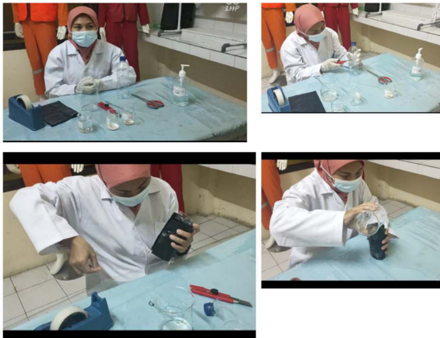
Figure 2. Demonstration Documentation through Video Making Ovitrap